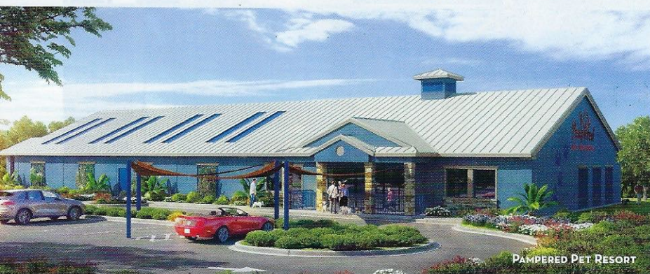
PAMPERED PET RESORT